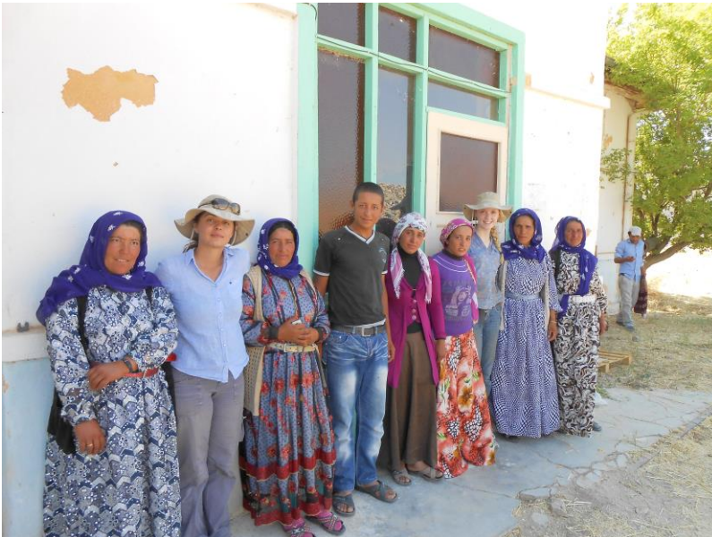
FIG 5: FIELD WORKERS IN YOZGAT

During my stay at CIMMYT I was given the chance to travel to Yozgat to assist with the harvest. There I experienced the vast difference between Turkish rural and urban life. While in Yozgat I