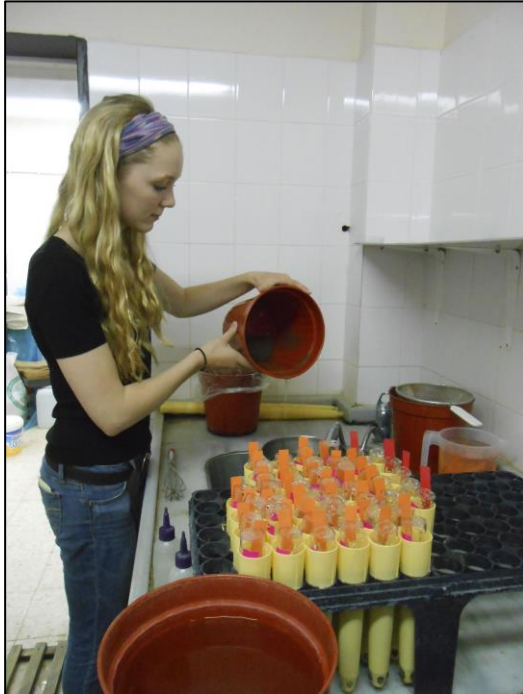
Fig 3: Pouring soil samples through the sieve system used to wash for nematodes