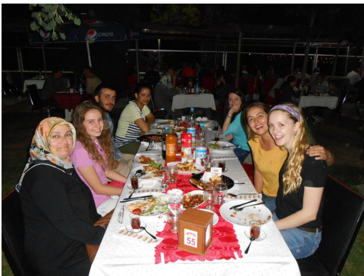
FIG 6: IFTAR WITH FRIENDS

I also experienced the everyday life of a Turkish citizen during my stay in Eskisehir. Surprisingly, urban life in Turkey is quite similar to that in America. Turkey is a relatively modern country in most regards. Some of my most enjoyable days were simply wandering around and exploring Eskisehir. Eskisehir was a beautiful city, and due to its two universities it was full of young college students and activities. Many of the leisure activities in Turkey are the same as they would be in the