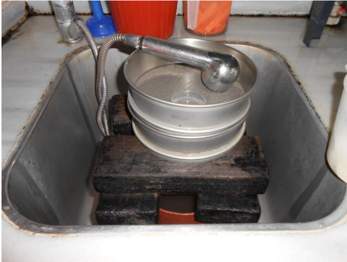
Fig 2. Sieve for Extracting Cyst Nematodes

Along with determining yield we determined nematode levels. Soil samples were taken using augers in the field, and directly from pots in the greenhouse. These samples were taken back to the lab where they were washed to sort out nematodes. Measuring nematodes initial population ( P_i ) at sowing time and nematode final population ( P_f ) at harvest time will enable us to study the nematodes reproduction factor by defining the P_f/P_i and give us indication of the tested lines if they are resistant or not.