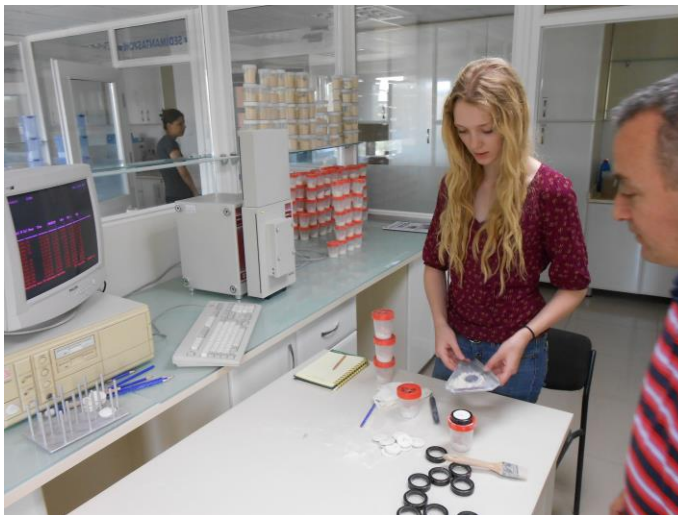
FIG 4. Preparing dish with while mill in order to measure protein content

First I was shown the NIRS machine, which measure protein value, moisture content, and Particle size index (PSI). In order to use this machine a small glass dish is filled with whole mill (Fig. 9). This dish is then placed inside of the machine and is read for all the previously stated values. PSI is used to determine the hardness of a particular breed of wheat. A small PSI value means that the wheat is hard, and preferable for making bread, whereas soft wheat is used to make things such as cookies and biscuits. The values obtained from the NIRS machine are all compared to the Quality standard line of wheat Bezostaja, a wheat variety from Russia. Unless a line exceeds a value from this breed of wheat it is not considered an improvement.